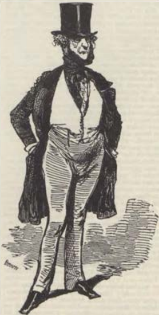
A SPECULATOR IN STOCKS.